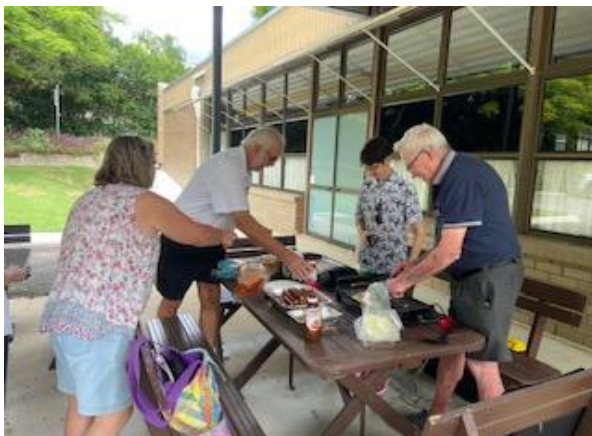
Members of Bayside CC, Qld CC and Roustabouts Club preparing sausage sizzle for delegates after AGM.