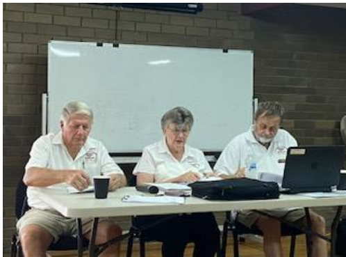
President, Secretary and Treasurer in action running the 2026 AGM.