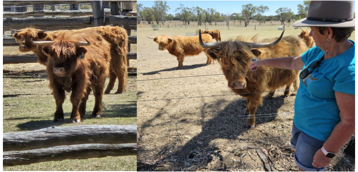
Scottish longhorn cows

Then followed a visit to “Bellevue Station” a sheep property dedicated to raising stud dorper sheep for their lamb meat. These sheep actually shed their fleece and there is no necessity to shear them.