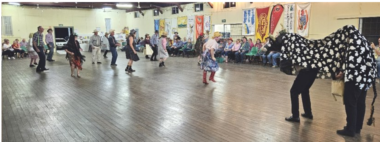
Queensland Club members kicking up a storm with their line dancing display accompanied by the Hoe-Down cow

Saturday evening was the Country Hoe Down dance hosted by the Queensland Club. They started the evening with a line dance demonstration and launched into a wide selection of old-time dances with everyone encouraged to participate.