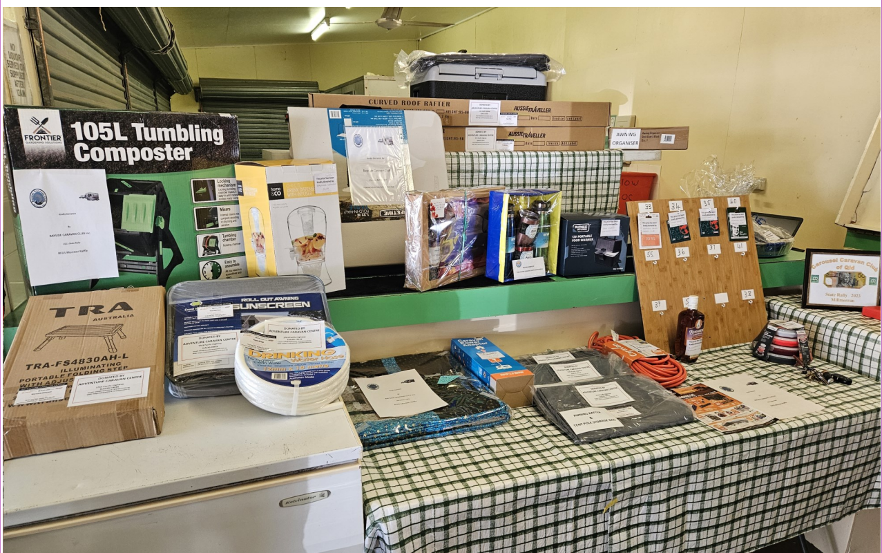
Monster Raffle Prize Pool