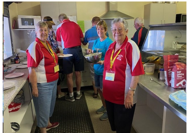
Kookaburra members cooking and serving their waffles