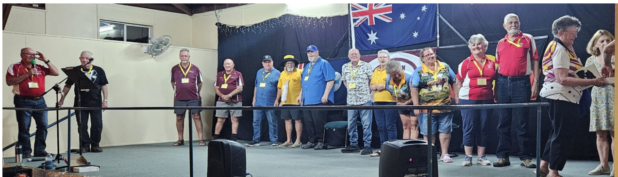
Giving out the prizes for the "Talent Quest" as all were winners.