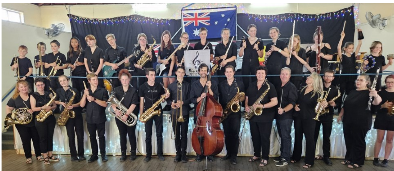
Pittsworth Community Concert Band

From 4.00pm the Pittsworth Community Concert Band entertained us with a wide selection of popular music.