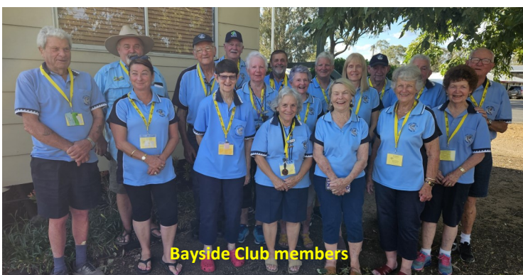
Bayside Club members