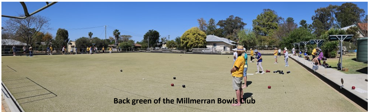
Back green of the Millmerran Bowls Club