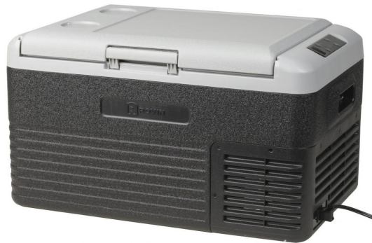
Brass Monkey Rovin refrigerator shown for illustrative purposes only

Thanks also to the Adventure Caravan Centre for their generous prizes.