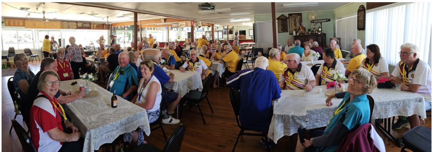
A sumptuous morning tea followed the barefoot bowls