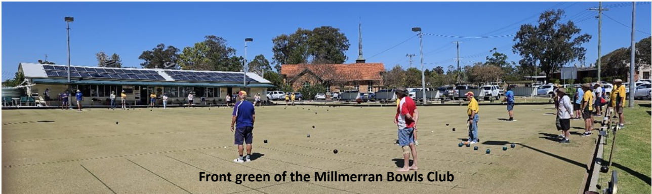
Front green of the Millmerran Bowls Club

Thursday was another very busy day with 76 members making their way to the Millmerran Lawn Bowls Club for a game of "Barefoot Bowls" that was followed by a sumptuous morning tea catered by Club's Ladies Auxiliary. Then in the afternoon members of the QCC conducted "Mini Downhill Drags". Great fun.