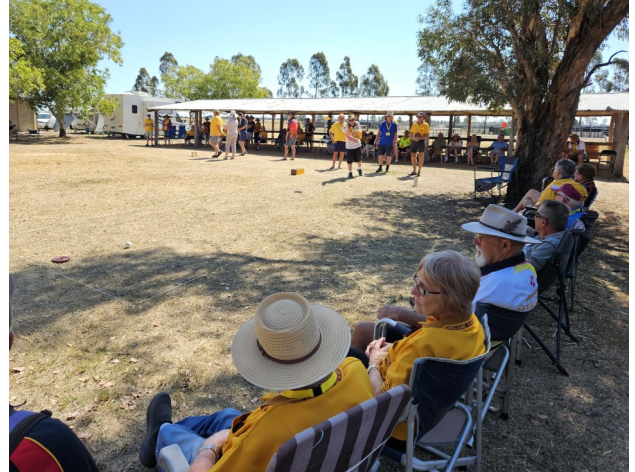
Enjoying the disc bowls competition