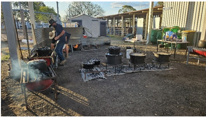
Camp oven dinner being cooked

Dinner on Thursday was a “Camp-Oven Meal” with a variety of dishes with vegetables followed by dessert.