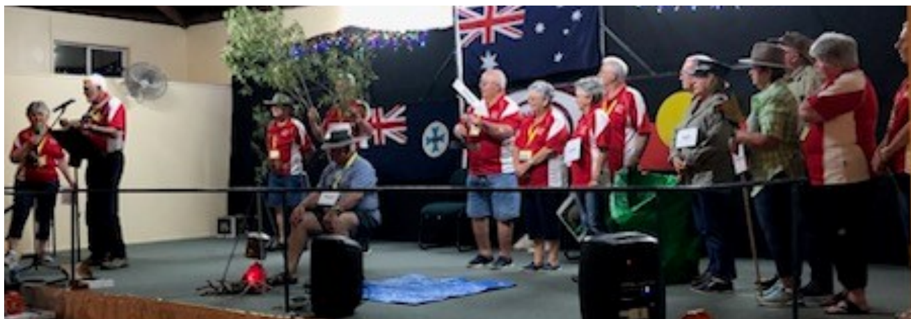
Once a jolly swagman camped by a billabong, Under the shade of a coolibah tree, He sang as he watched and waited 'til his billy boiled.