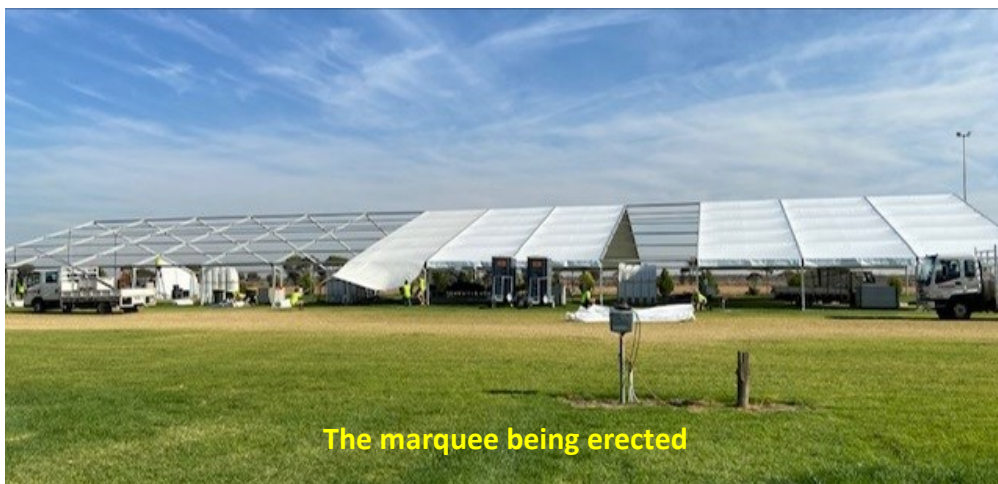
The marquee being erected