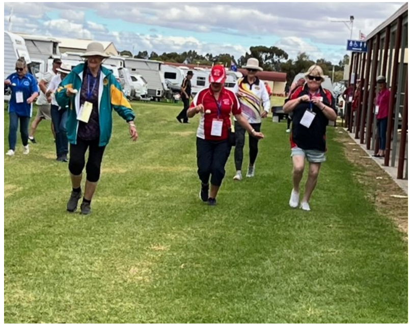
Not so serious with the egg and spoon race