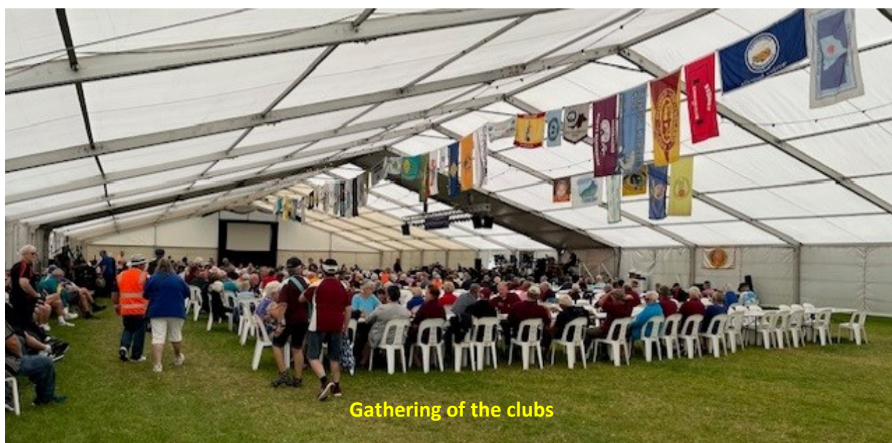
Gathering of the clubs