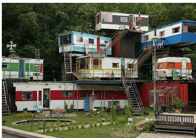
Rest Home for Retired RV's

Try out the Avida web site to see if you qualify as a grey nomad.